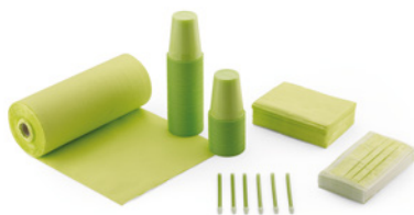
Kit Monoart® lime