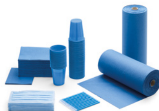
Kit Monoart® blue