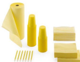
Kit Monoart® yellow