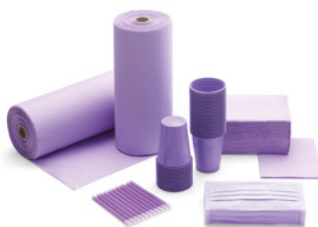
Kit Monoart® lilac