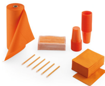
Kit Monoart® orange