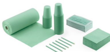
Kit Monoart® green