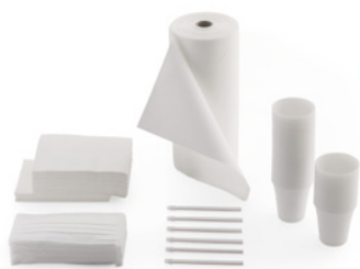
Kit Monoart® white