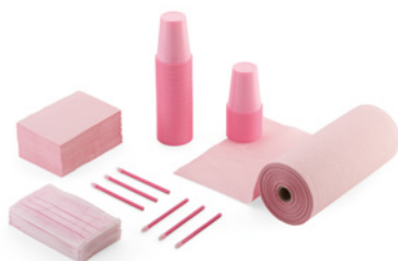
Kit Monoart® pink